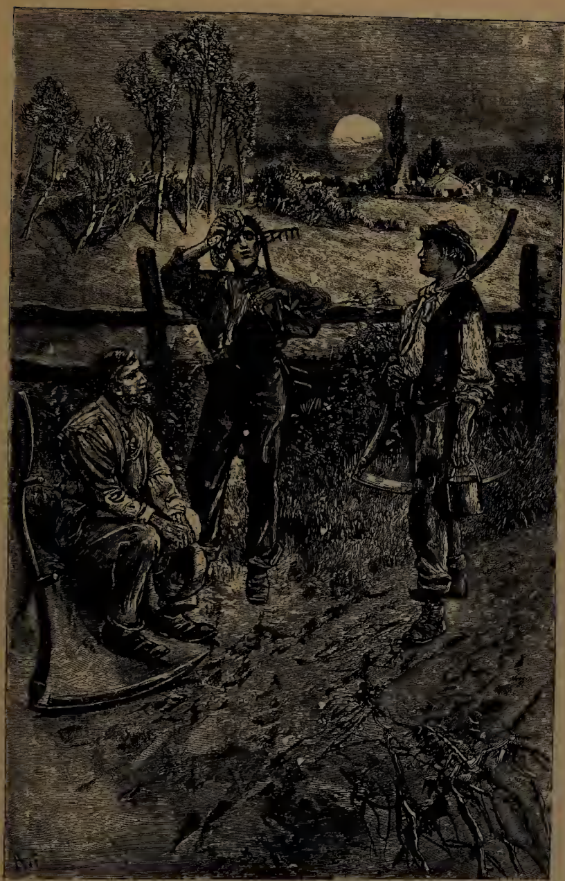
“ WITH SUN-TROD FACES AND HORN-GLOVED HANDS ”